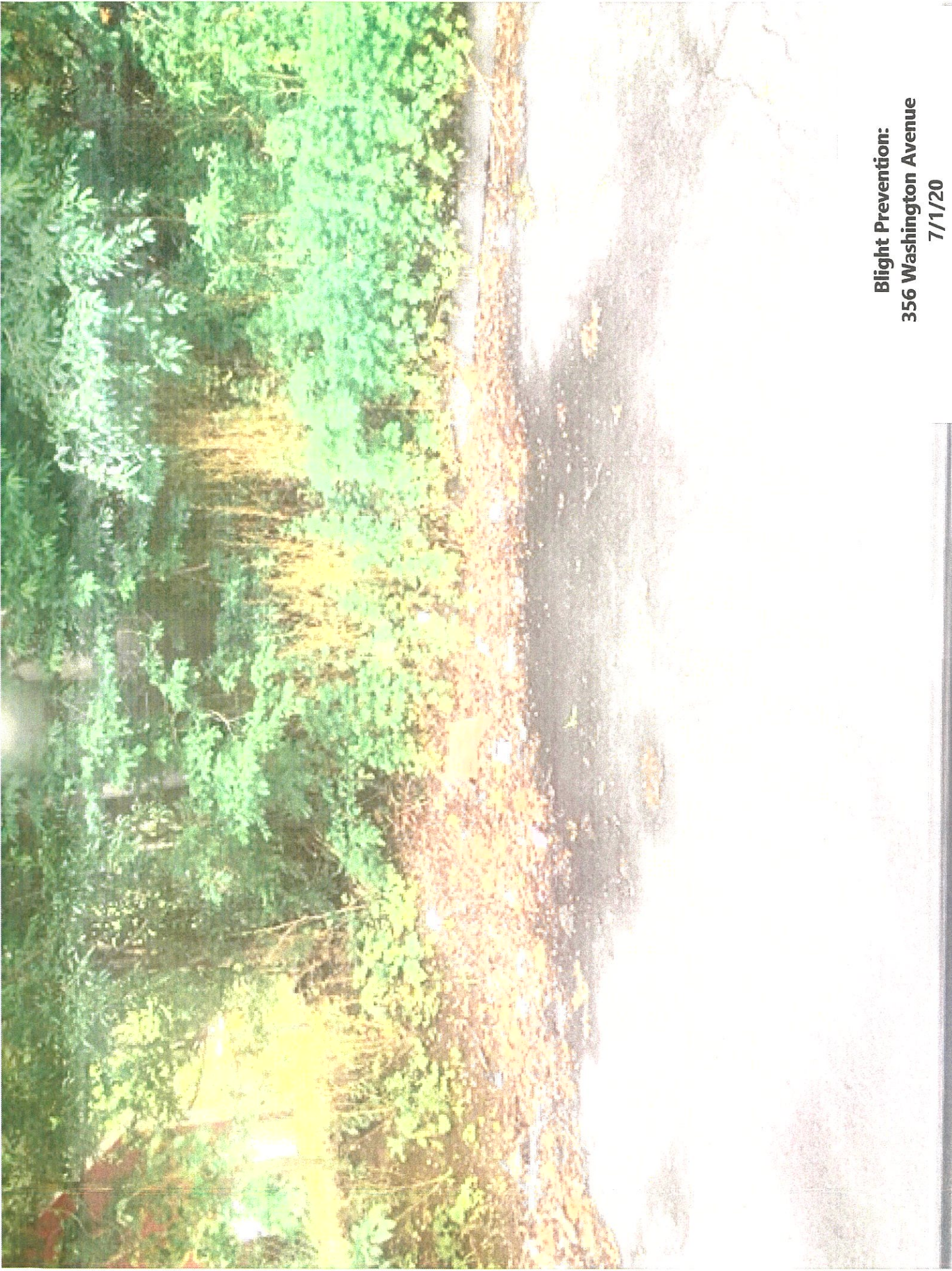
Blight Prevention: 356 Washington Avenue 7/1/20