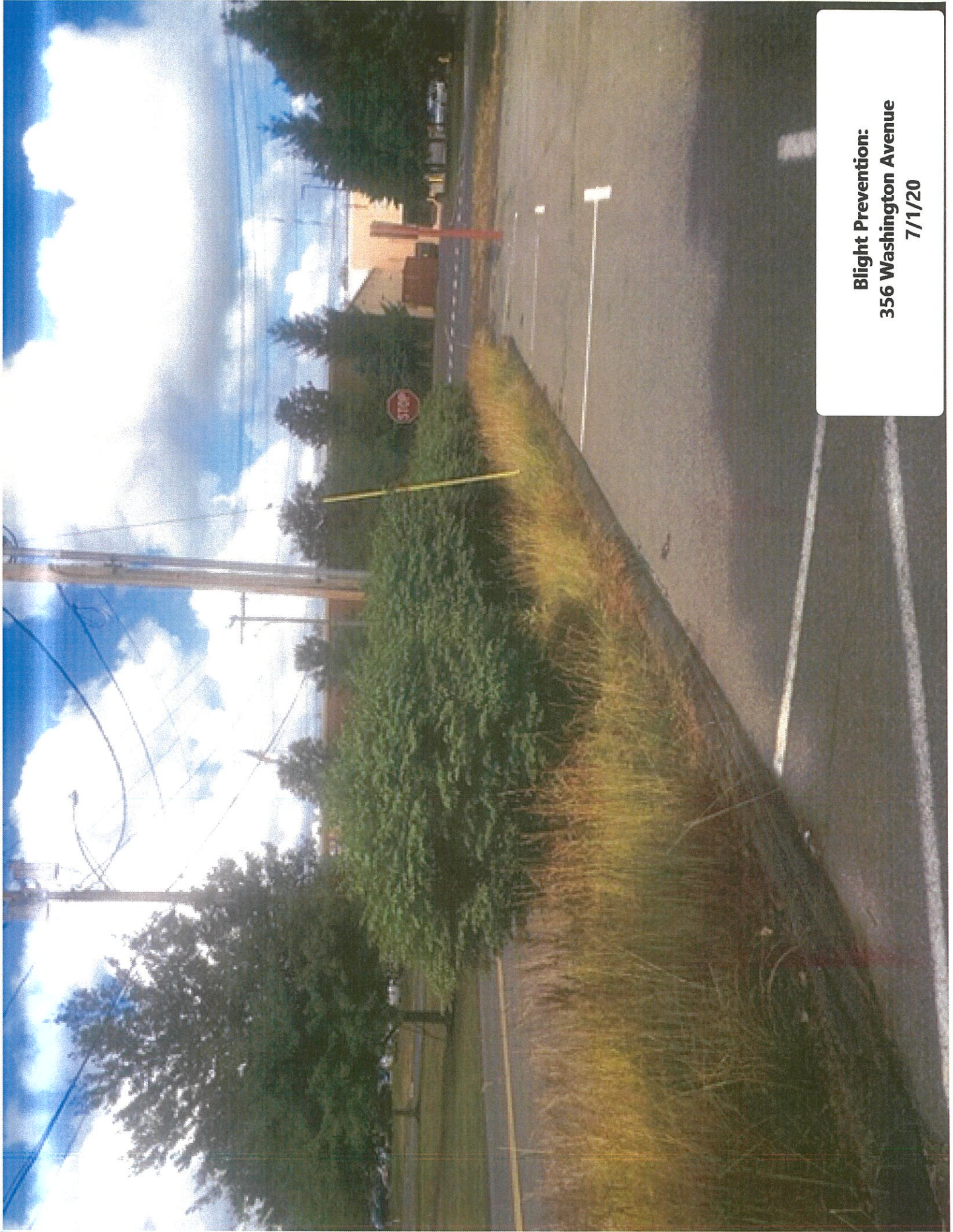
Blight Prevention: 356 Washington Avenue 7/1/20