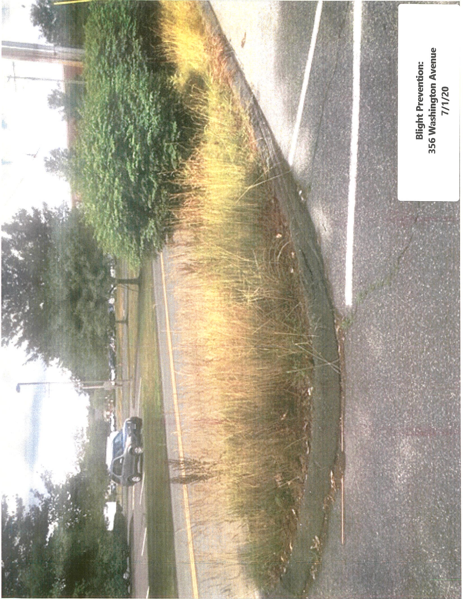
Blight Prevention: 356 Washington Avenue 7/1/20