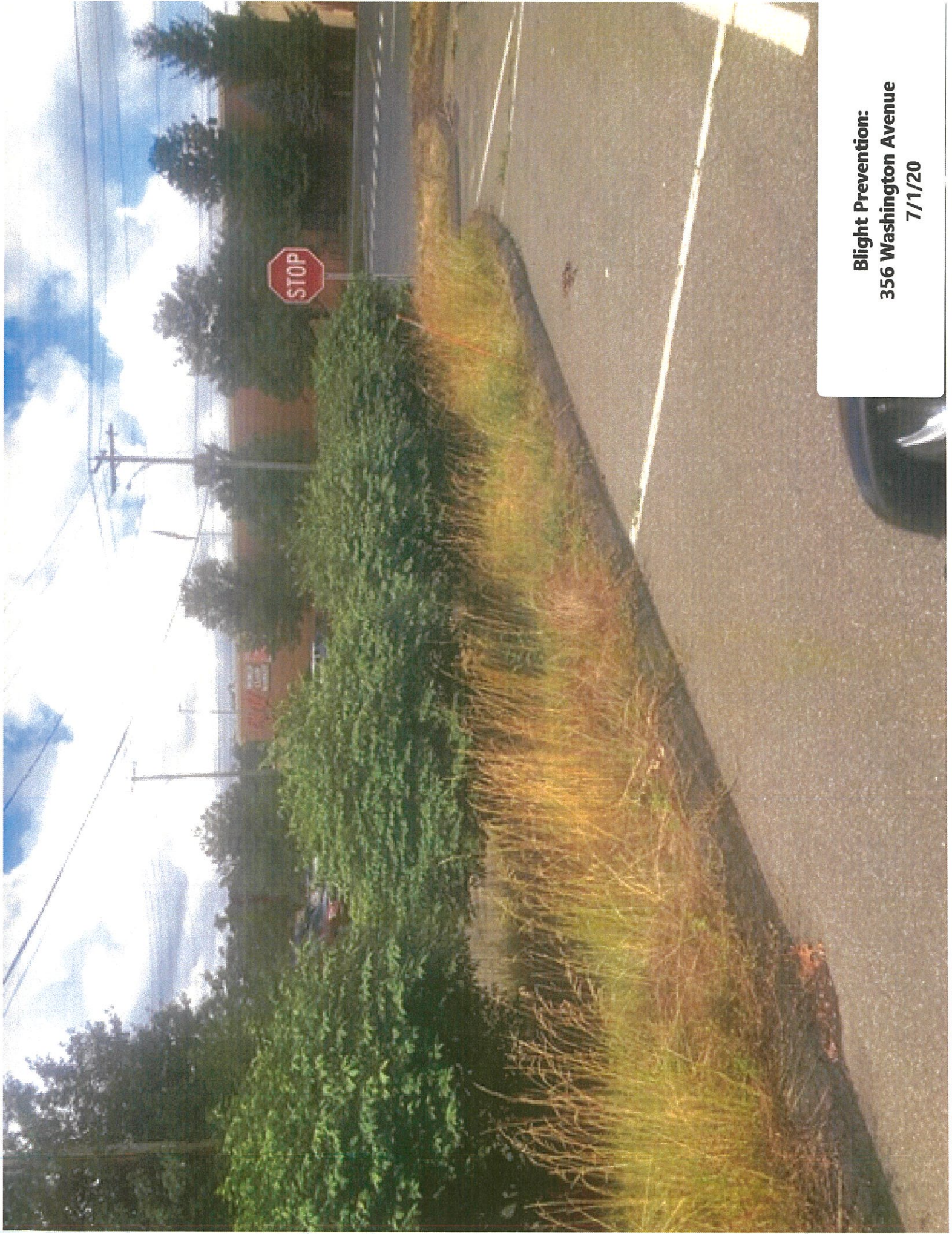
Blight Prevention: 356 Washington Avenue 7/1/20