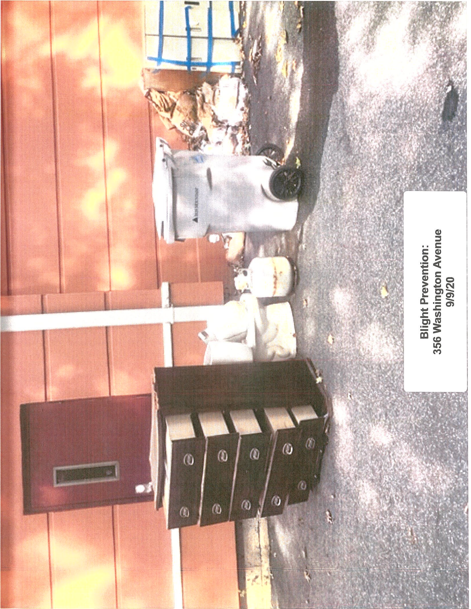
Blight Prevention: 356 Washington Avenue 9/9/20